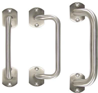
PH13150D PH13150CS PH19178