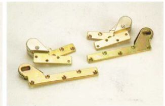
▲ OFFSET PIVOT <Left Hand, Right Hand available>