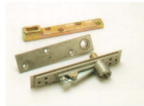
▲ STANDARD STRAP, TOP AND BOTTOM PIVOT